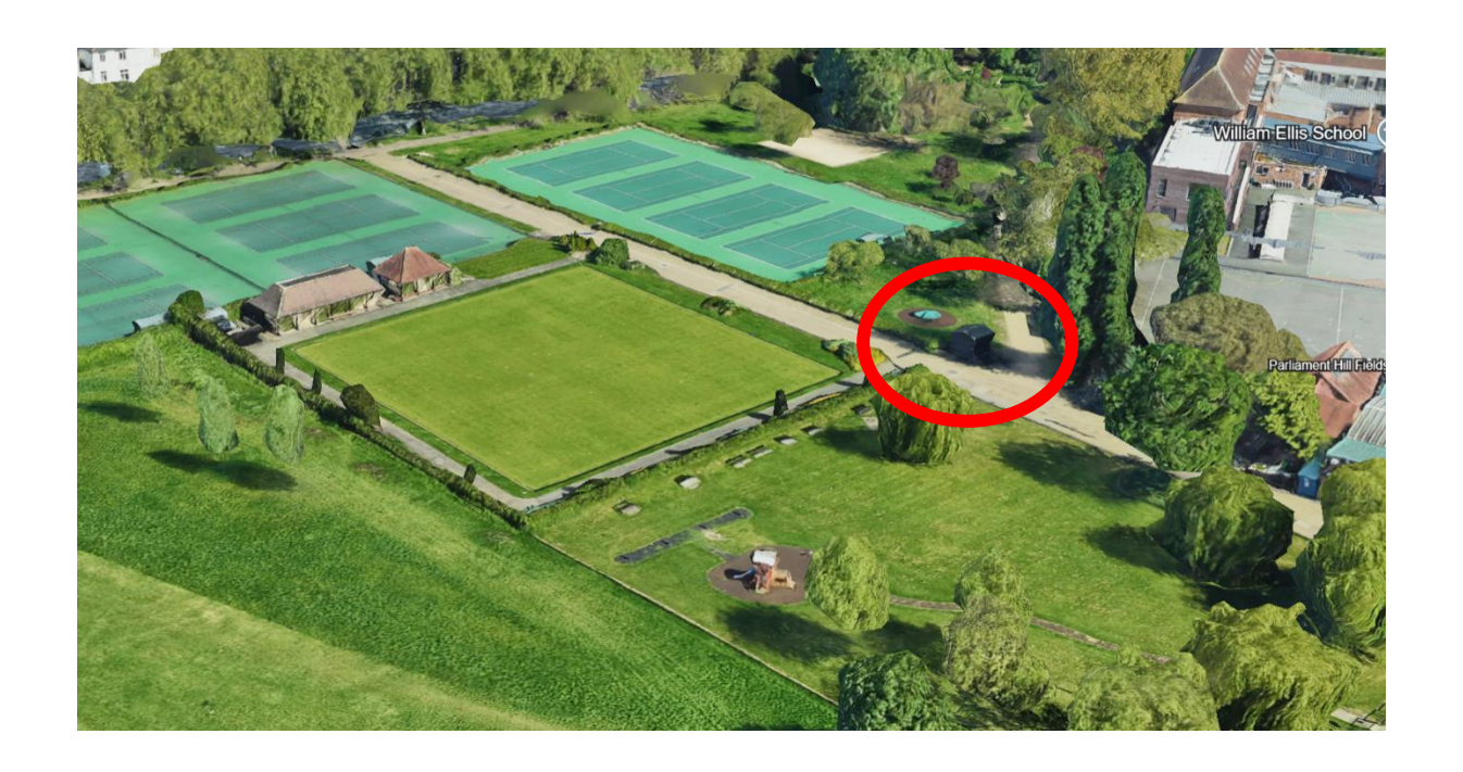
APPENDIX 1: Former 'Tennis Booking Hut' at Parliament Hill